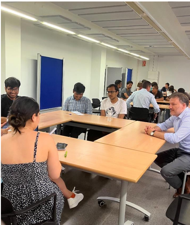
Photo: BNZ educational chat with students in UPC university